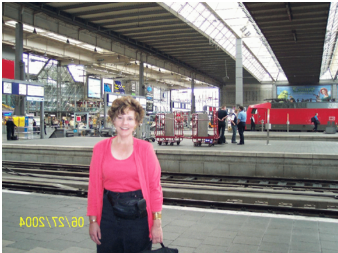
Waiting for our train at the Hauptbahnhof - the main train station in Munich