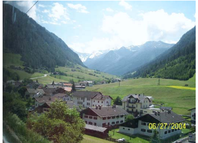
Gorgeous vistas as we cross through the Alps.