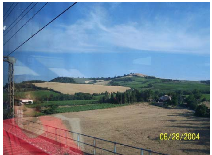
Reflections on Tuscany.