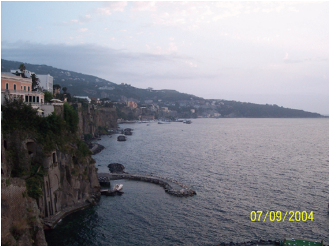
Overlooking the Bay of Sorrento.

The Amalfi coast lead us to Sorrento. Sorrento is a charming city with very narrow and busy streets. We stayed in Sorrento for two nights, taking one day to visit Pompei, a city that was uncovered after being buried by the eruption of Mt. Vesuvius in approximately 79A.D. We enjoyed an “enchanted” evening at a Sorrentine restaurant for dinner our final night as we listened to live Italian music. - Cheryl and Wayne