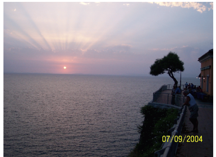
We end the day with a beer at sunset. Truly - la dolce vida!