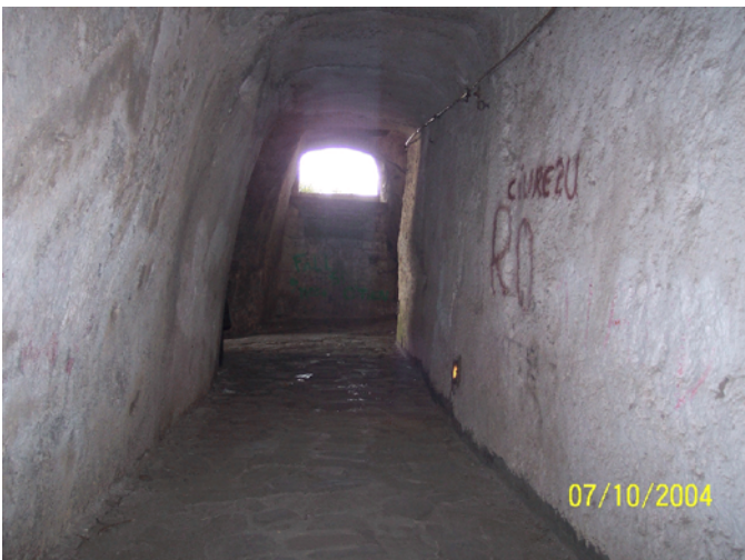
A long, narrow, and winding tunnel is an alternate route to the beach and restaurant at the bottom of the cliff. We opted to take the interesting walk.