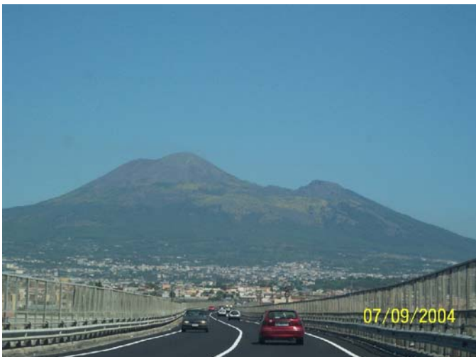
A view of Mt Vesuvius as we drive to Pompei.