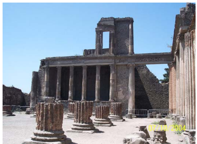
The uncovered remains of Pompei. The “old” city of Pompei” is surrounded by the “new” city of Pompei.