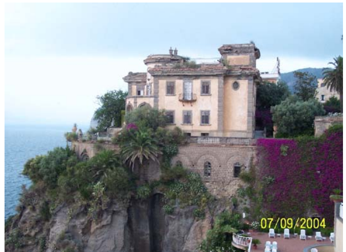
A cliffside residence.