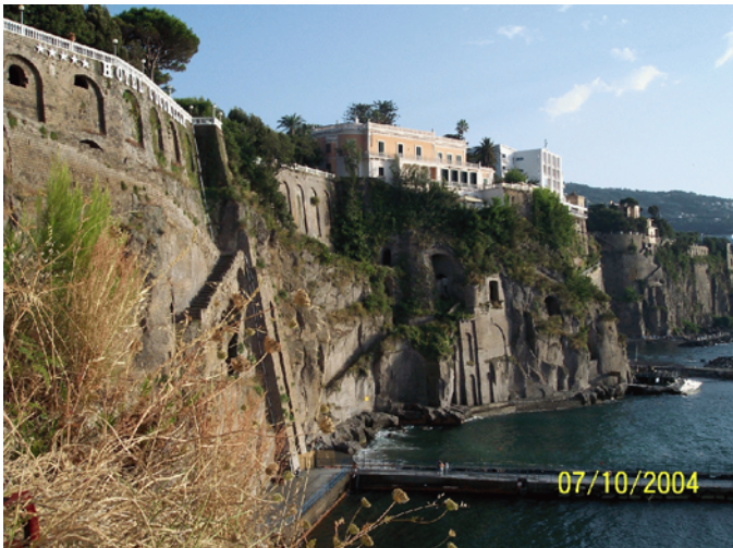
An elevator will take you down the cliff to the beach and restaurant below in Sorrento.