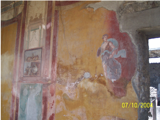
A fresco that survived after being buried for 1800 years.