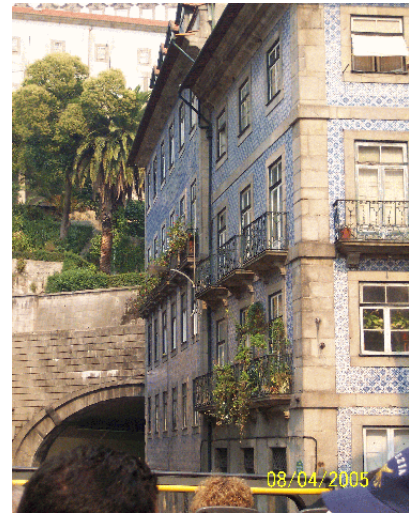
Commercial and residential buildings are also make use of ceramic tile on their exterior walls.