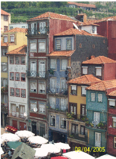
A view of a typical Porto city street with stores on the ground floor and apartments and homes on the top floors.