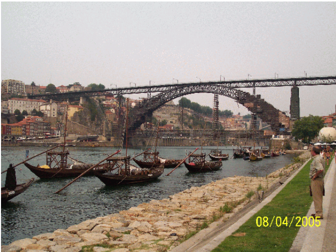
We journey across the river to visit the “Wine Caves” of the famous Porto wine producers.