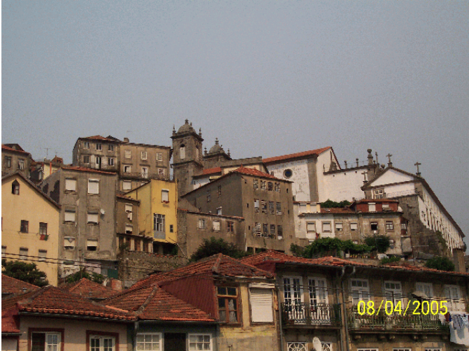
Buildings are stacked one above the other and one next to the other.