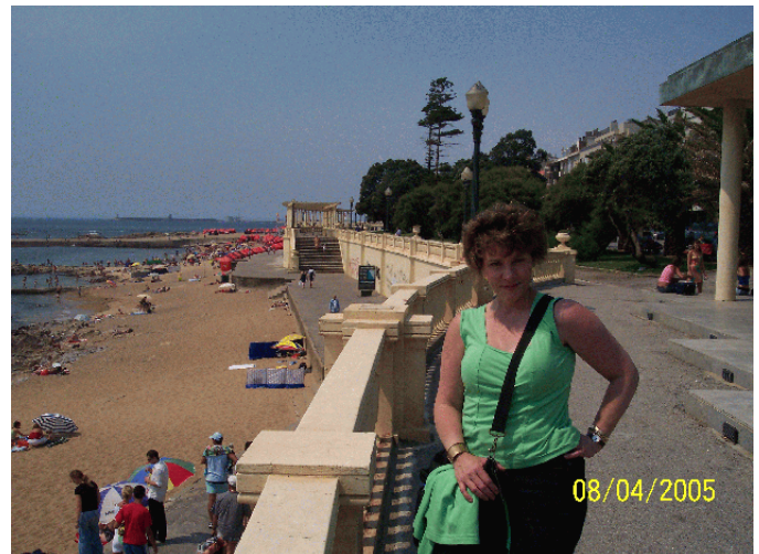
We stop to watch beachgoers on our way to lunch - at Pizza Hut.