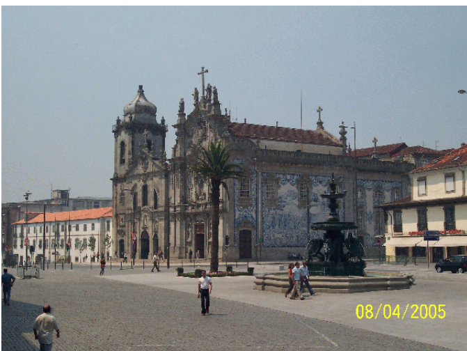
Another church and another ceramic tile mural on the walls.