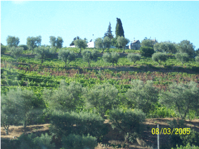
The countryside is covered with vineyards as we enter the region of Porto.