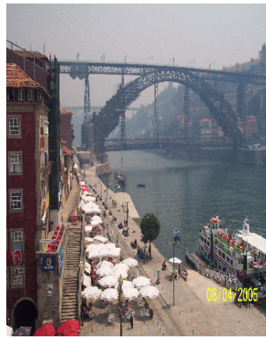
A view from our hotel room at the Pestana Porto Hotel. This bridge connects the north and south side of the river.