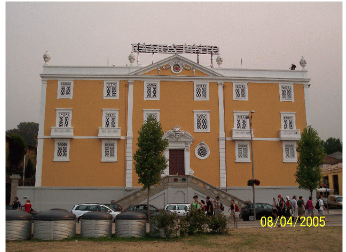
The only wine maker we visit boasts our family name - Ramos Pinto.