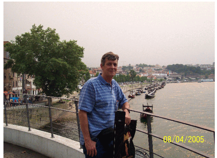
My handsome driver helps to carry my purchases from the Ramos Pinto gift shop.