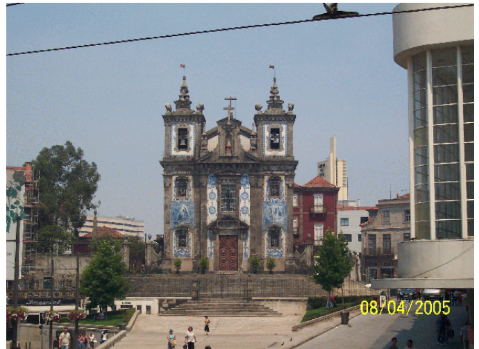
A grand cathedral in Porto with ceramic tile murals on its walls.